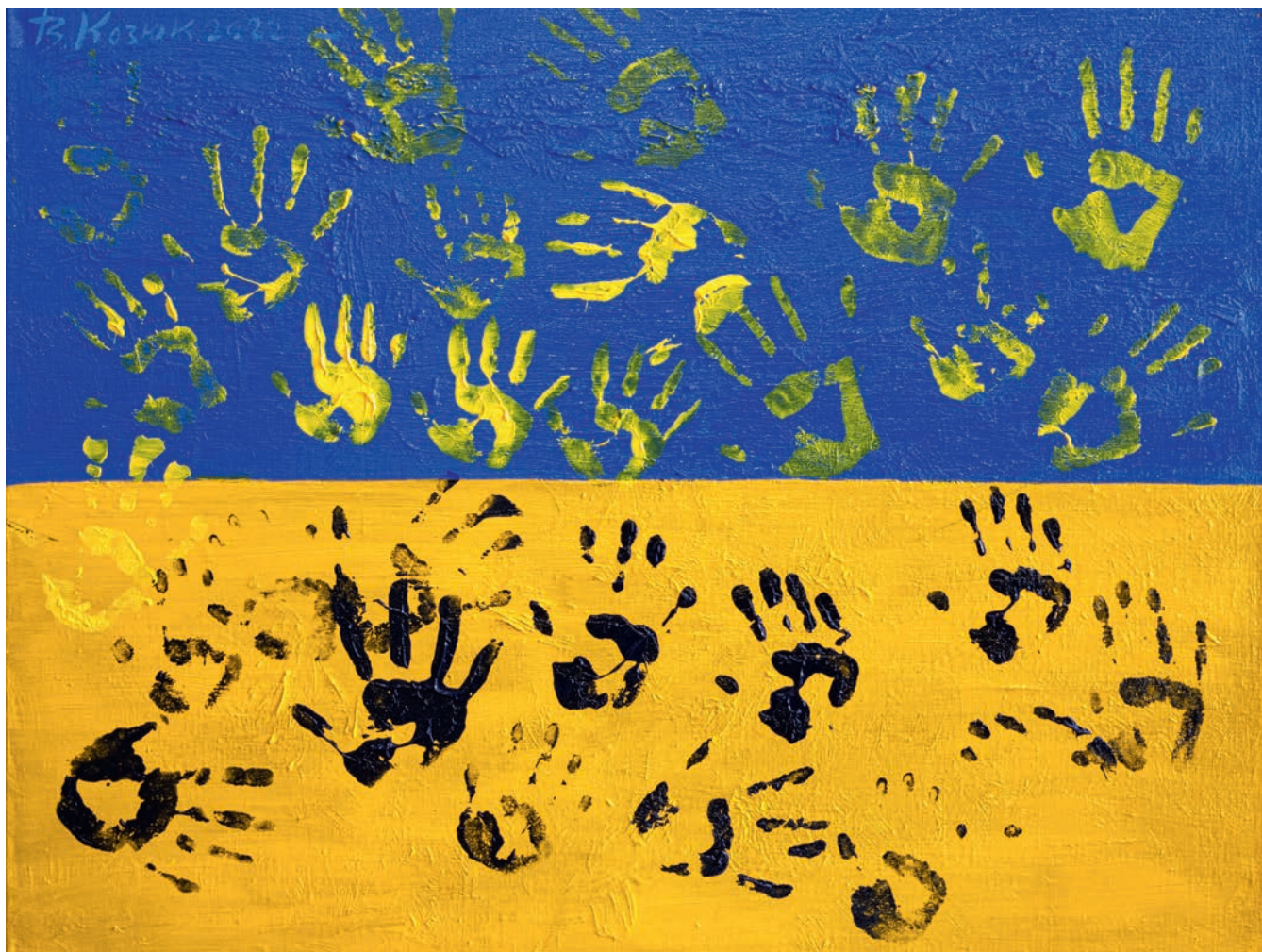
«Ukraine» 70x90. Canvas, oil. 2022. The work was performed together with refugee children from all regions of Ukraine.