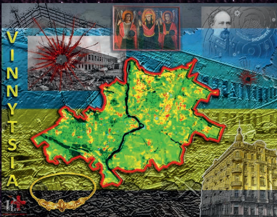
Work from the series «Cities of Heroes»