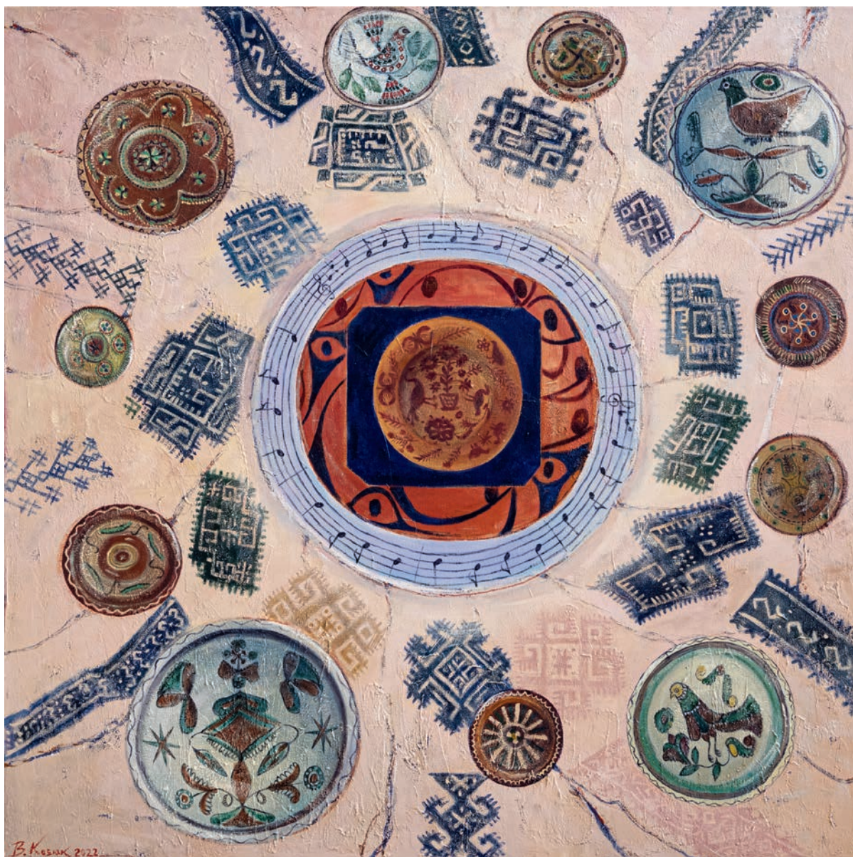
«Podillya song. Shchedryk pours into the world, Shchedryk pours into Eternity... Carol of the Bells »180x180. Author's technique.