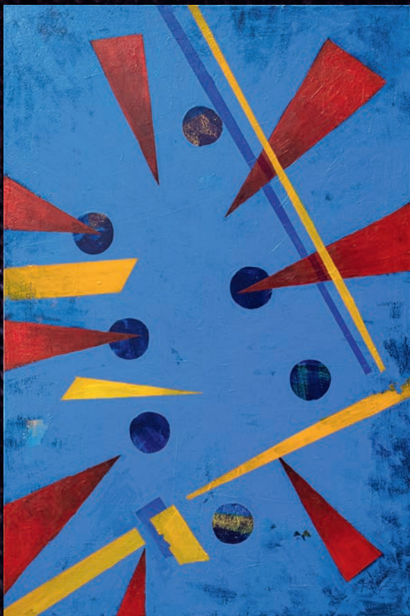
«Air alarm» 120x180.