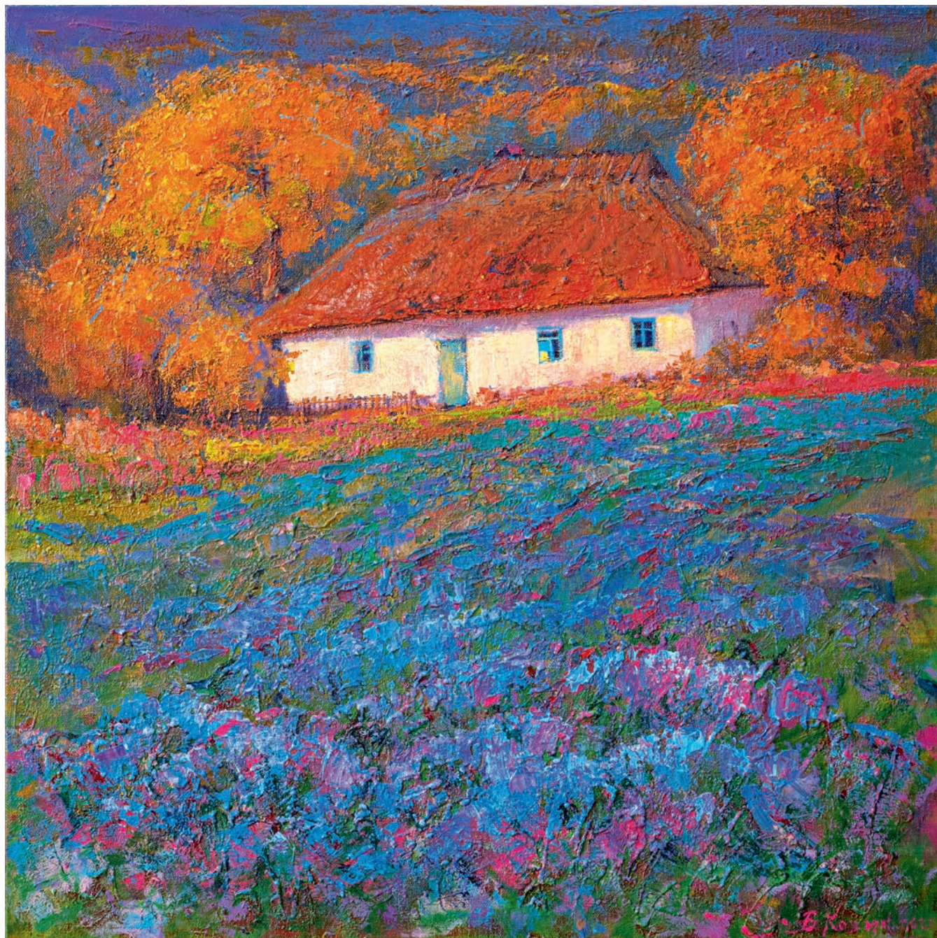
«The house is under a roof, and flowers grow in the shadows» 120x120. Canvas, oil. 2022.