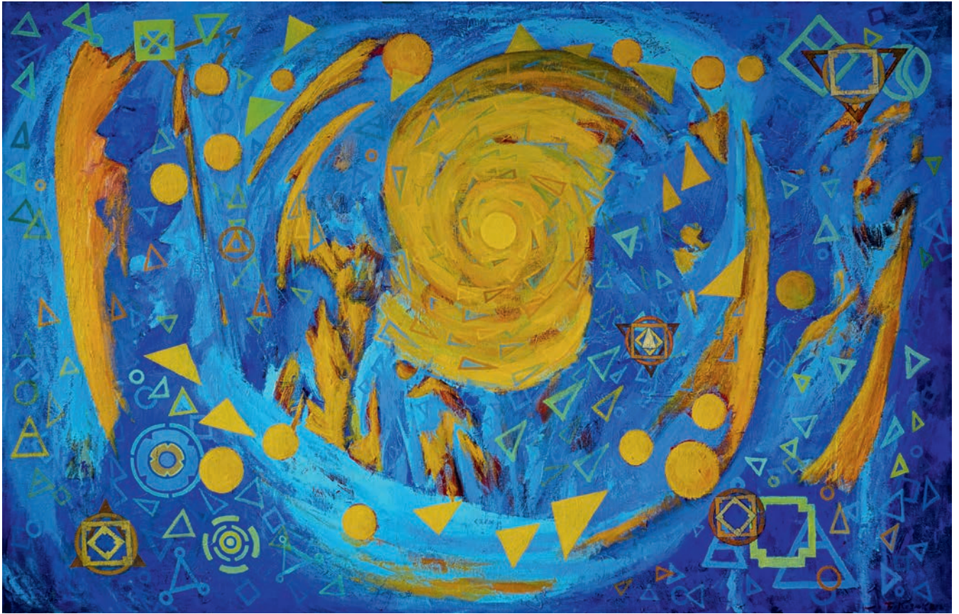
«Birth» 180x280. Canvas, oil. 2021.

Birth. The non-motivational functions of art are, in essence, the truest manifestation of art, because they are the least susceptible to outside influence. The basic human instinct of harmony, balance and rhythm. At this level, art is not an action or object, but an inner desire for harmony (beauty), consumed regardless of its usefulness. Thus, everything created on this planet without the main purpose of sale, praise or pride, created as beauty, as knowledge and traditions – is art as such. The main thing for an artist is his freedom, imagination, and style is not so important. The joy of creativity is the main thing, because we can only create as a creator, for him we are the children who will carry knowledge to society, will show the way. Each of the artists is Prometheus in his societies, regardless of where this society is located, on which continent and in which country. Everything flows like sand through your fingers, only art is eternal. Art gives us a method of nonverbal application of imagination, without restrictions, art gives a wide range of forms, symbols and ideas, the meaning of which can be interpreted differently, but it does not matter, because the process itself is the most important element of etheric particles.