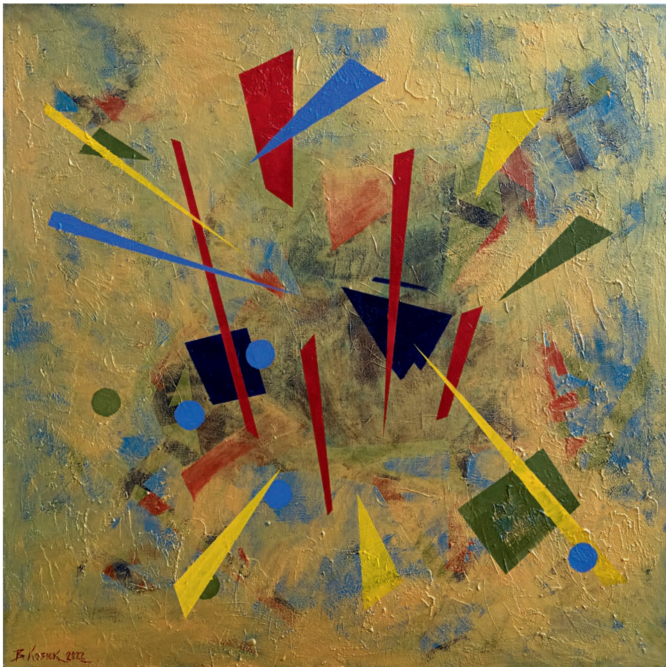
«The Way of the Winners», canvas, author's technique 180x180, 2022

What are these winners like? They are different, they have gone their own way, the way to Ukraine, they are fighting to the end, sometimes they are taken as prisoners, sometimes they die, and sometimes they are seriously wounded, without medicine, water and food in surrounded and inhumane conditions. They come out with a grenade launcher in a clear field one on one with the tank. They fight in the air in one plane against three. They line up the newest enemy plane with an old rocket launcher. They are titan warriors. They are parents, grandparents, sons, doctors, postmen, plumbers, artists, policemen, teachers, drivers, people of any profession who have set out on this path for the sake of children, freedom and truth! They are all winners, everyone's destiny is different, someone is being tortured at this time. Not everyone will see that day of victory. But the truth in the world is one, everyone has their own honor, and conscience is from God! Pray for them – both for the living and for the dead – because there is no other way. Only victory is ahead!