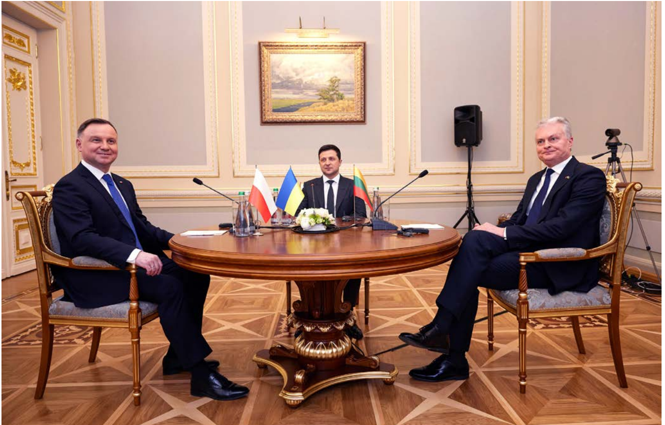
February 23, 2022 President of Ukraine Volodymyr Zelenskyy met with President of the Republic of Lithuania Gitanas Nauseda and President of the Republic of Poland Andrzej Duda, who arrived in Belarus on a visit. The talks between the leaders of the three states took place at the Mariinsky Palace in Kyiv.