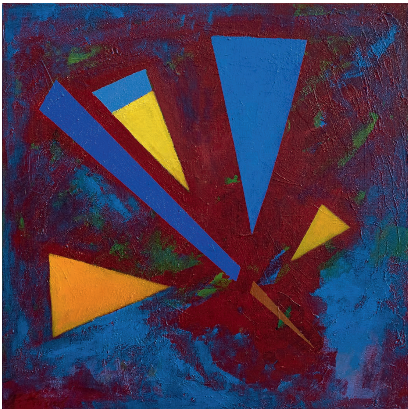
«Birth of a Nation», canvas, author's technique 120x120, 2022