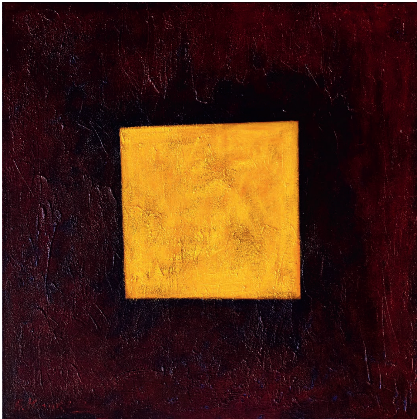
«Pure Soul», canvas, author's technique 120x120, 2022.