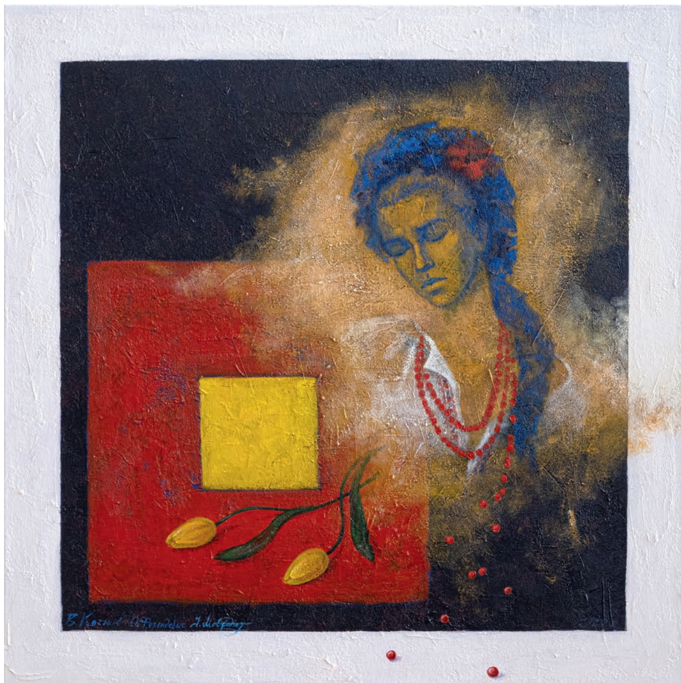
«Hymn of Peace» 120x120. Canvas, oil. 2022. Based on Karimierz Malewicz «Black Square» co-authored with Iwona Malewicz and Aleksandra Ferendowych